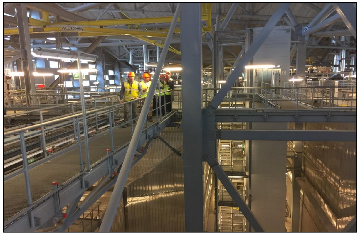
Photographs inside Amager Bakke Waste Facility and how close it is to recreational facilities