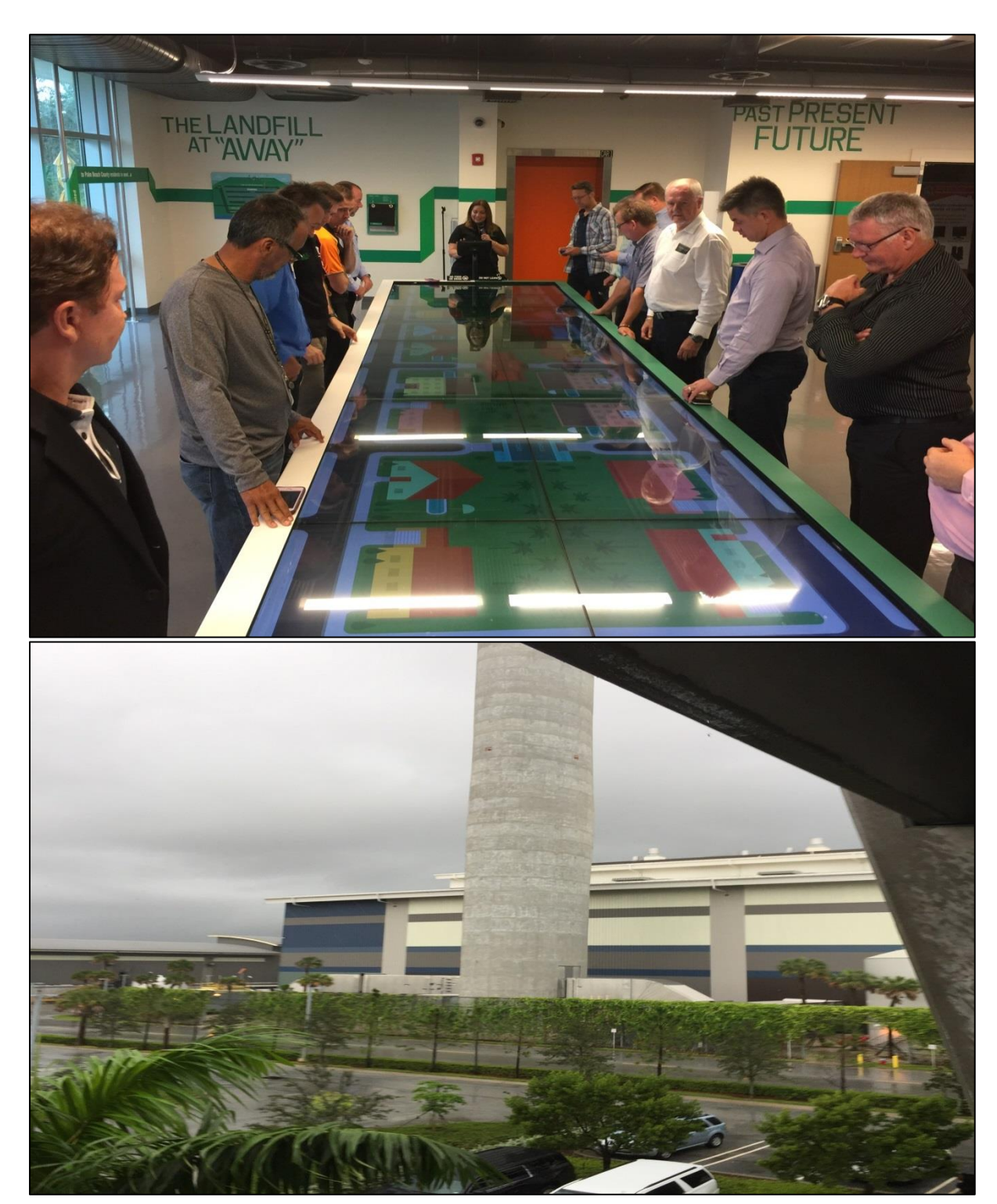
Photographs Solid Waste Authority of Palm Beach County Waste Facility