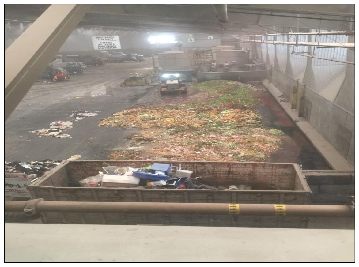
Photographs Puente Hills Material Recovery Facility - Los Angeles