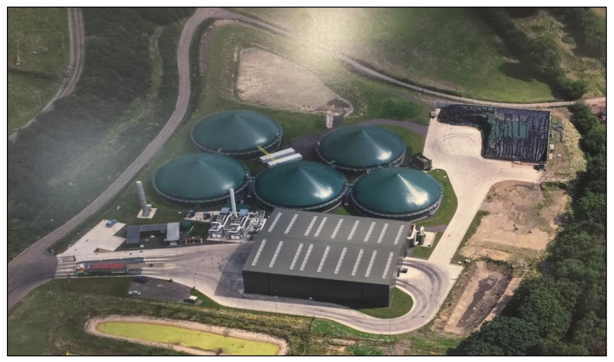
Photographs Agrivert Anaerobic Digestor - London