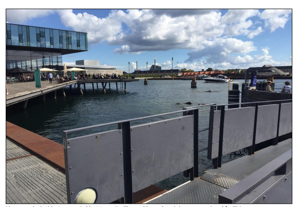
Photographs inside Amager Bakke Waste Facility and how close it is to recreational facilities