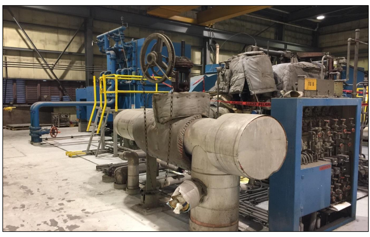
Photograph Covanta Camden Energy Recovery Centre Facility Philadelphia

Three mass burn 350 ton per day boilers supplying steam to a common header spinning two 16.85MVA turbine generator sets, and fed by two overhead P&H motorized grapple cranes. Combustion is controlled by an ABB S+ distributed control system and a Forney burner management system