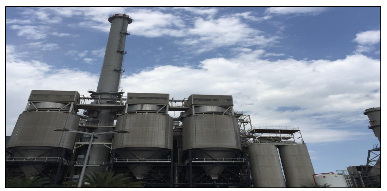
Photograph Ecoparc Facility in Barcelona

The Eco-park of the Mediterranean is located in Sant Adrià de Besòs, a developing district situated on the Mediterranean coast at the mouth of the river Besòs and is close to high income areas. The plant is located a short distance from the resource (household waste) which reduces transport costs. This strategic location showcases that the clean technologies used at this facility do not have a negative impact on the immediate environment.