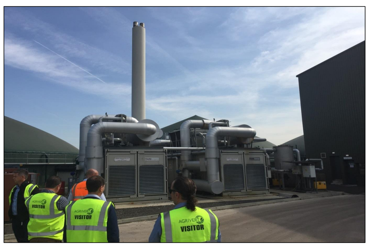
Photographs Agrivert Anaerobic Digestor - London