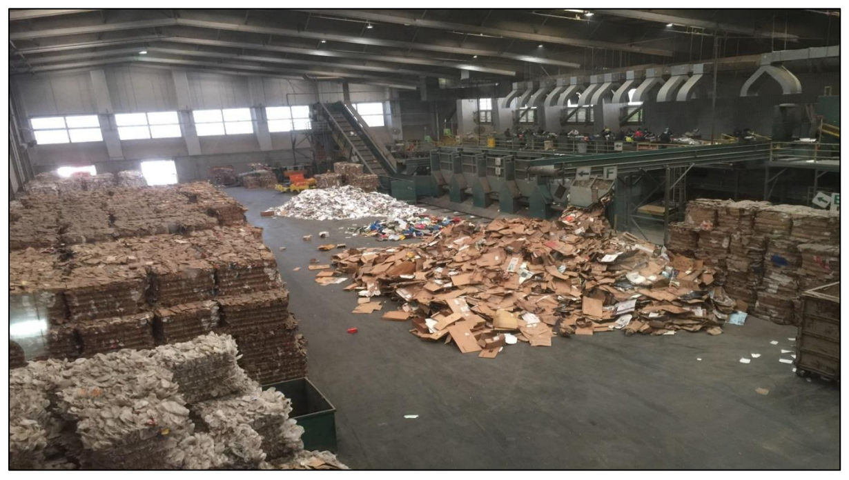
Photographs Puente Hills Material Recovery Facility - Los Angeles