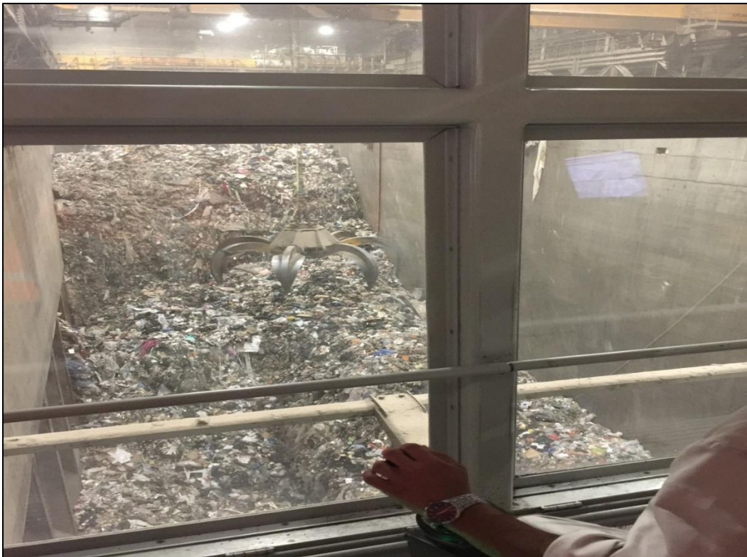
Photographs Corey Incineration Facility - London