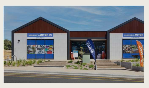
BALLINA, NSW DEVONPORT, TAS SORRENTO, VIC