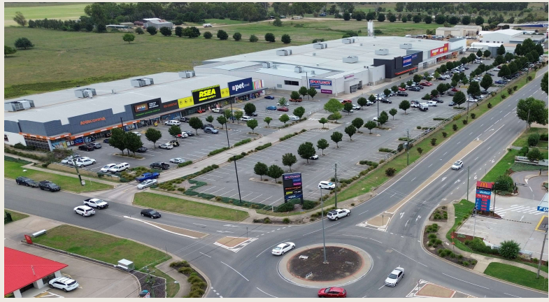
HomeCentre Wagga Wagga