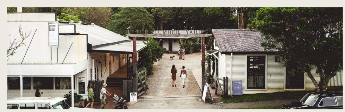
BALLINA, NSW BANGALOW, NSW