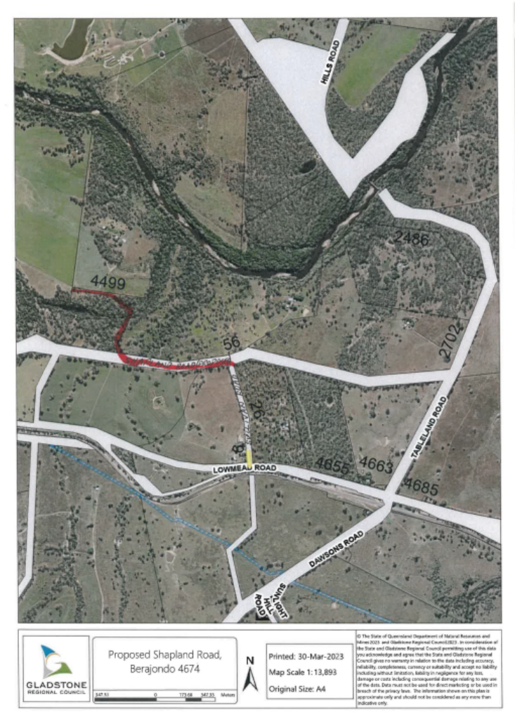
Figure One: Copy of Map Supplied by Applicant with proposed location