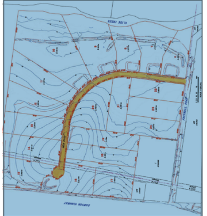
Figure One: Proposed Development Friswell Road, Burua.