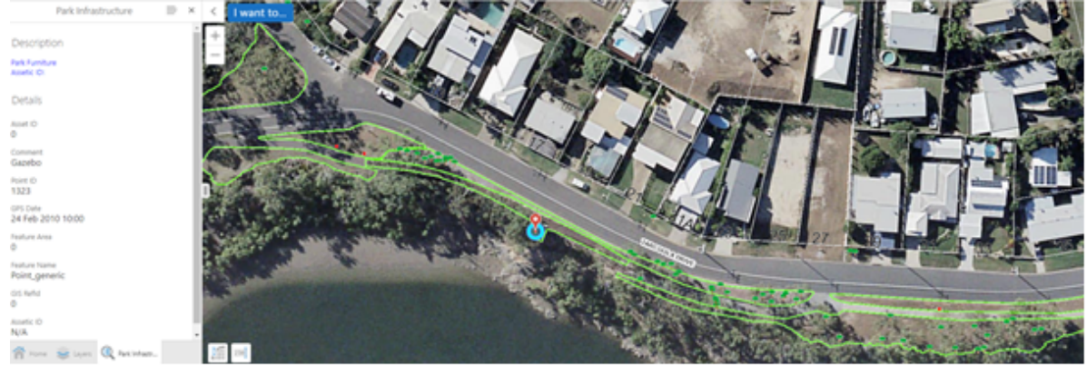
Figure One: Aerial view of proposed location