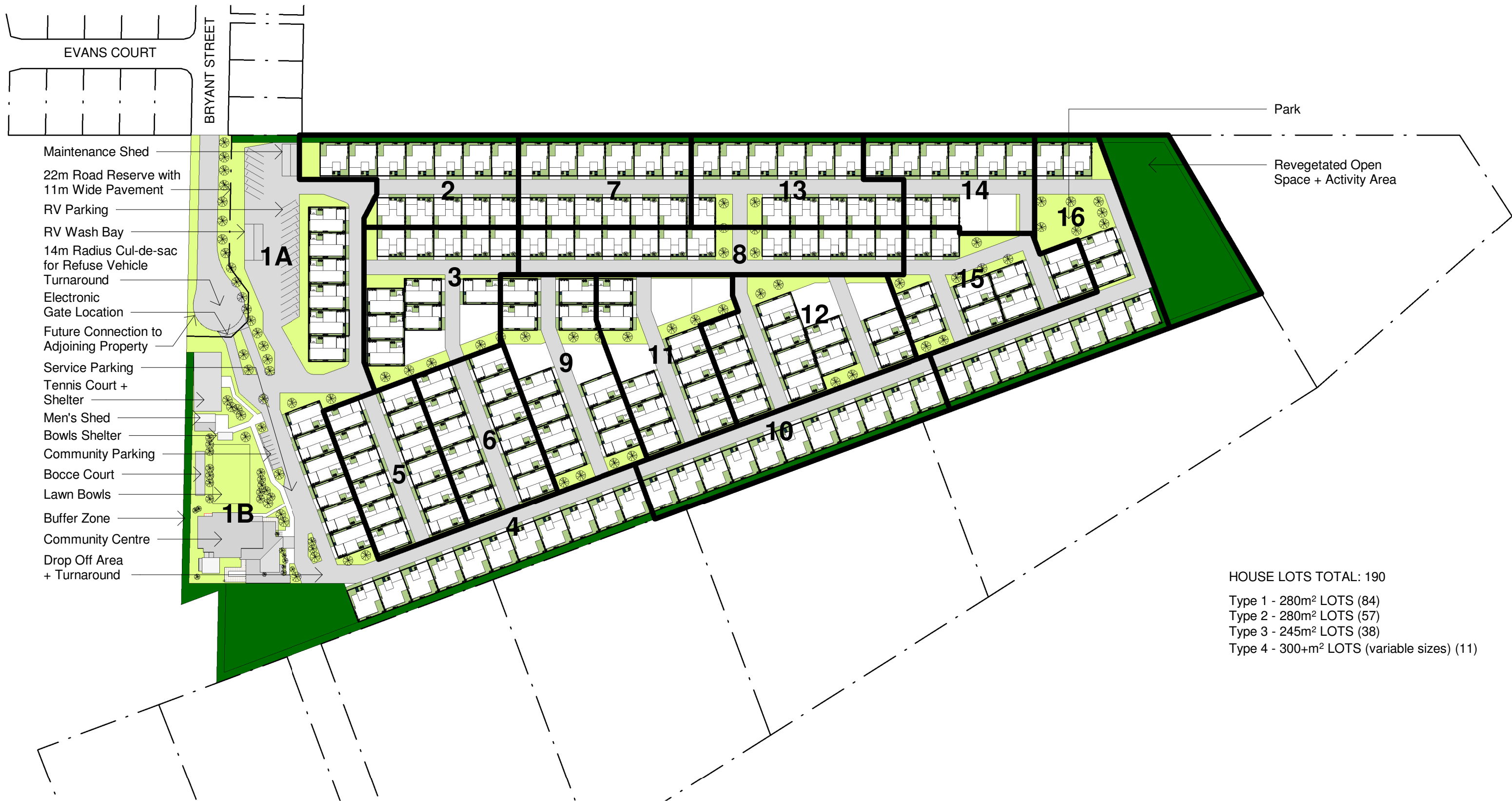
1 Site plan 1:2000

HOUSE LOTS TOTAL: 190 Type 1 - 280m 2 LOTS (84) Type 2 - 280m 2 LOTS (57) Type 3 - 245m 2 LOTS (38) Type 4 - 300+m 2 LOTS (variable sizes) (11)