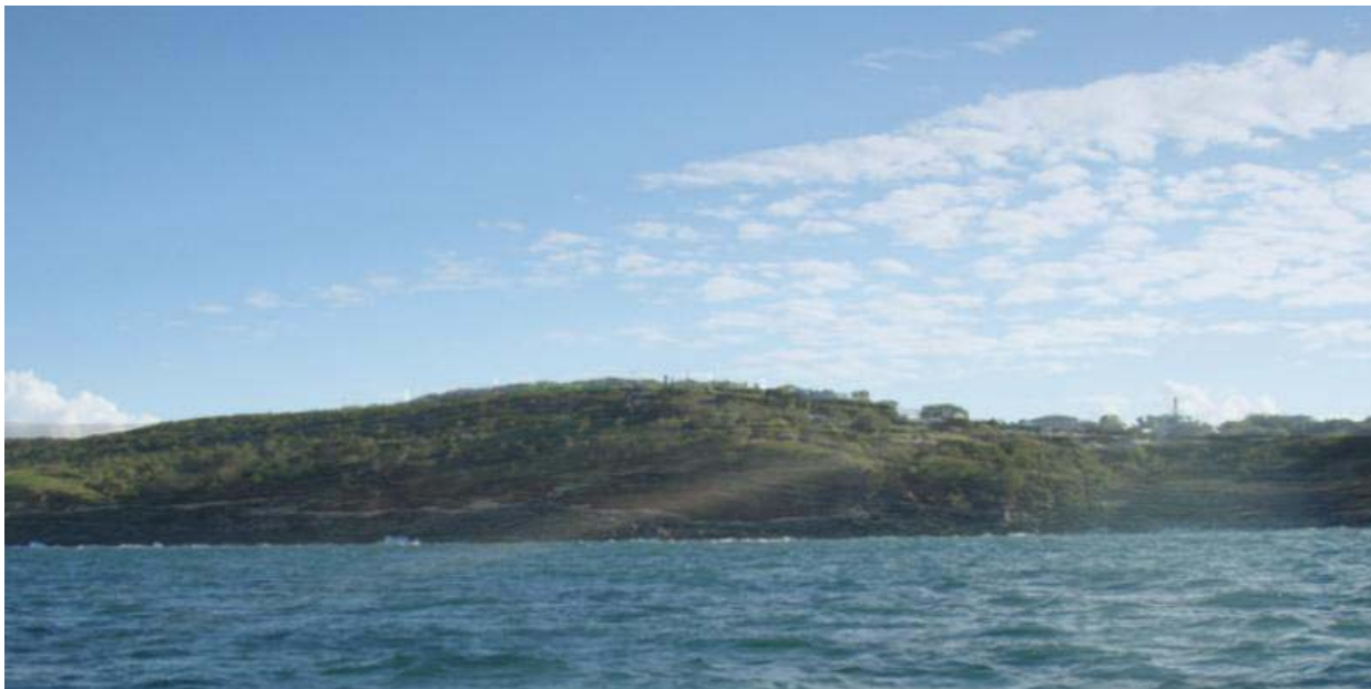
View from the ocean side looking southwest towards the headland site.