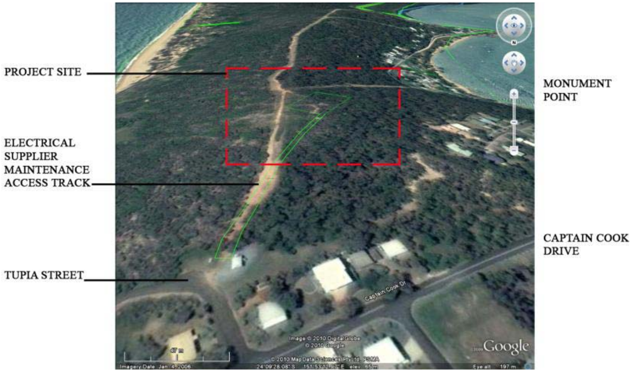
The project site at Round Hill Headland, Seventeen Seventy.